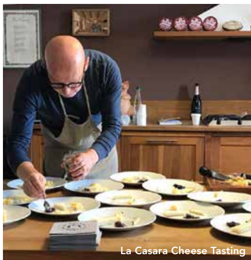
La Casara Cheese Tasting