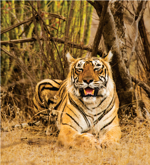
Bengal tiger rests in Ranthambore.