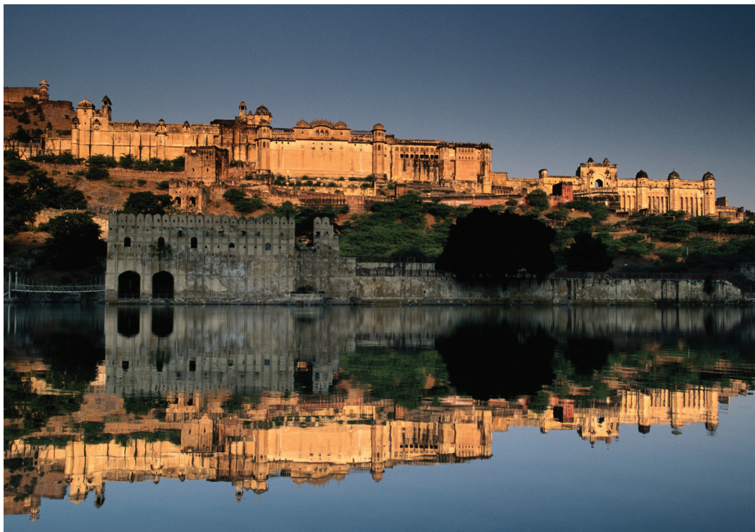
Visit Amber Fort, a UNESCO World Heritage site, on Day 6.

Day 8: Jaipur/Ranthambore We travel today to Ranthambore National Park, the former hunting ground of the Maharajah of Jaipur and now a 512-square-mile natural preserve that is home to hundreds of species of birds, reptiles, mammals, and of course, Bengal tigers. This afternoon we take our first game drive through the park. B,L,D