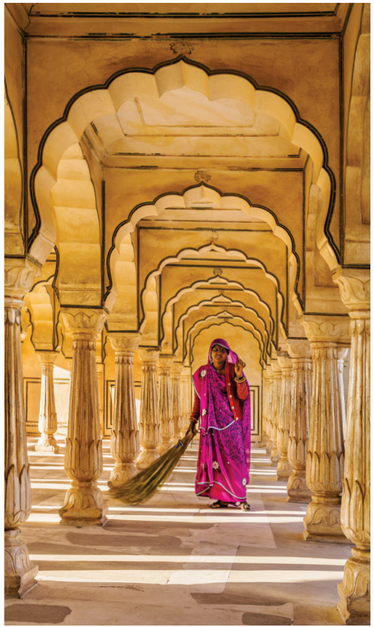
Amber Fort, former Rajput capital

Day 17: Return to U.S. Very early this morning we transfer to the airport for our return flight to the U.S.