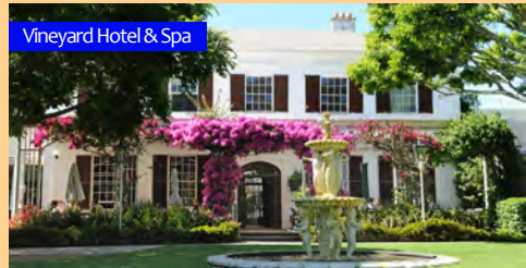
Vineyard Hotel & Spa

Rovos Rail in Pullman suites: Step aboard the wood paneled coaches – classics remodeled and refurbished to mint condition – and enjoy fine cuisine in five-star luxury. The rebuilt sleeper coaches contain beautiful suites, offering every modern convenience and comfort.