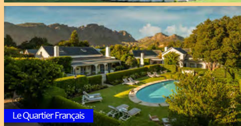
Le Quartier Français