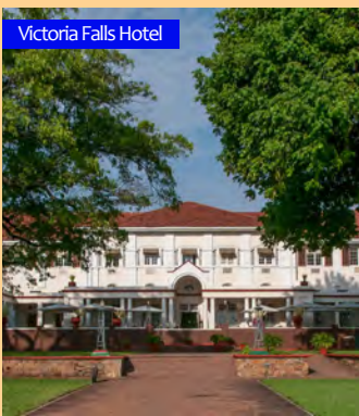
Sheraton Pretoria Hotel