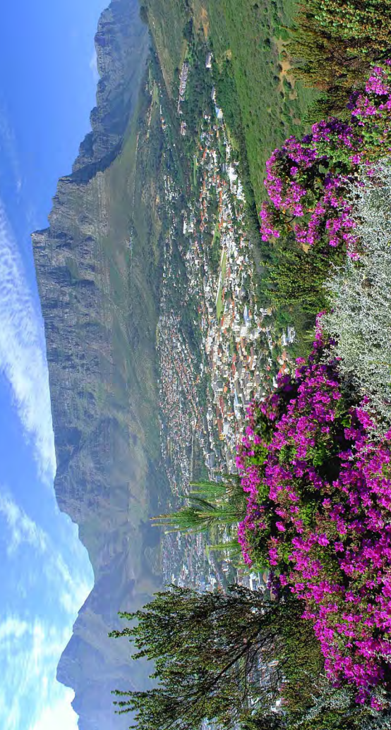
Classic Escapes protects our planet. ♻️

204 W. Washington St. Washington and Lee University Office of Lifelong Learning Lexington, VA 24450 Fax: (540) 458-8478