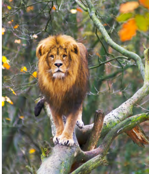
Lion on tree in Kruger National Park